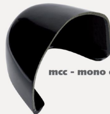
mcc - mono coque cap